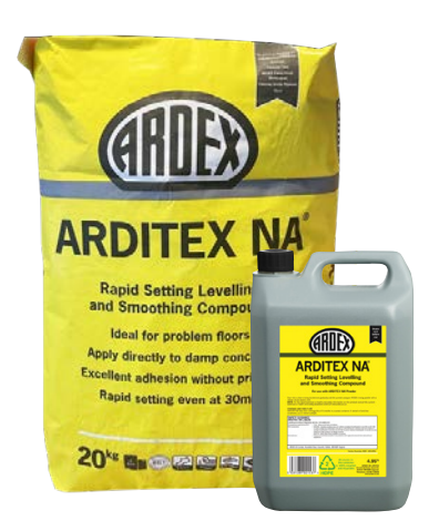
the original yellow bag<sup>®</sup>

REDUCES THE NEED FOR EXPENSIVE PREPARATION AND PRIMING EXCELLENT ADHESION TO ALMOST ALL SUBSTRATES WITHOUT PRIMING: FLOORING GRADE PLYWOOD, BITUMEN ADHESIVE RESIDUES, GLAZED AND UNGLAZED CERAMIC TILES, QUARRY TILES, STEEL, FLOORING GRADE ASPHALT, ADHESIVE RESIDUES UNAFFECTED BY MOISTURE CAN BE USED UNDER AN ARDEX DAMP PROOF MEMBRANE, ARDEX MVS 95 MOISTURE VAPOUR SUPPRESSANT AND EVEN DIRECT TO DAMP CONCRETE EXCELLENT FLOW, AS SMOOTH AS A WATER MIX WALK ON IN 2 HOURS APPLY RESILIENT FLOORCOVERINGS AFTER ONLY 4 HOURS AND CERAMIC TILES AFTER 3 HOURS CAN BE APPLIED UP TO 30mm WITH THE INCLUSION OF ARDEX COARSE AGGREGATE ULTRA RAPID SETTING EVEN AT THICKER APPLICATIONS ADVANCED PERFORMANCE, EVEN AT LOWER TEMPERATURES 5m² COVERAGE AT 3mm SUITABLE FOR USE ON FLOORS WITH UNDERFLOOR HEATING CAN BE USED TO ENCAPSULATE UNDER-TILE HEATING CABLES MARINE APPROVED LOW ODOUR AND PROTEIN FREE.