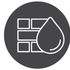
Damp Proof Membrane