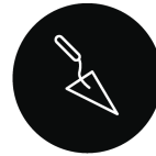
Damp Proof Course